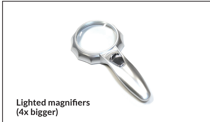
Lighted magnifiers (4x bigger)