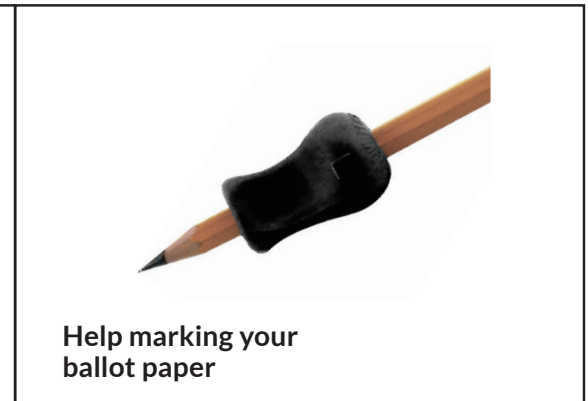
Help marking your ballot paper