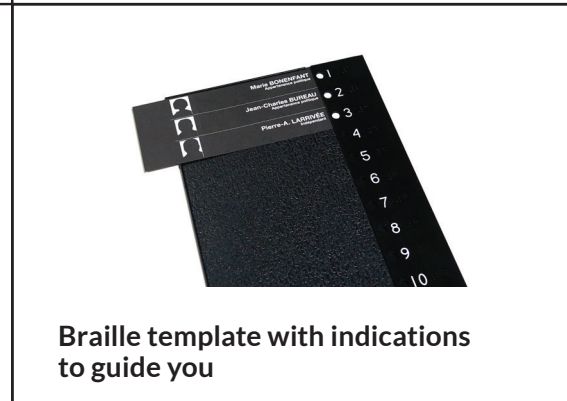
Braille template with indications to guide you